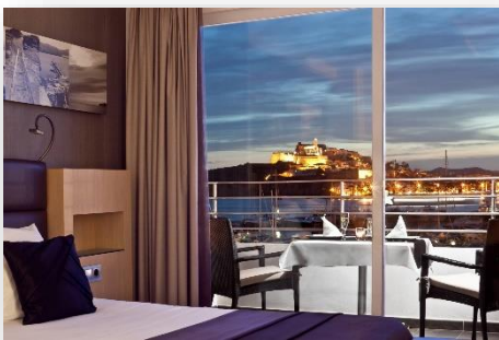
Deluxe Room Sea View