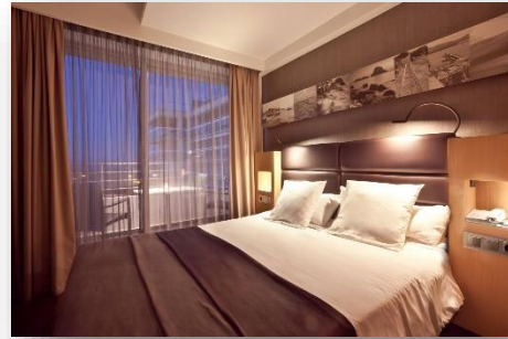
Deluxe Room Montain View